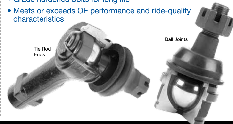
Tie Rod Ends